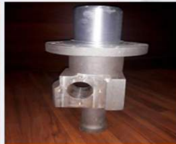
ES/DS MSM HSG Wt: 11.5Kgs