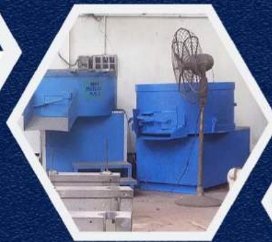
Sand Mixing Machines

Our factory is well equipped with modern facilities for best quality products.