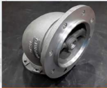
Emergency Valve Wt: 3.5 Kgs