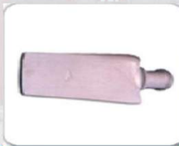
Fan Blade Used in Agro.....