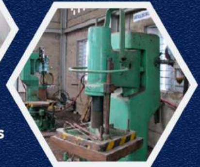
Sand Moulding Machines