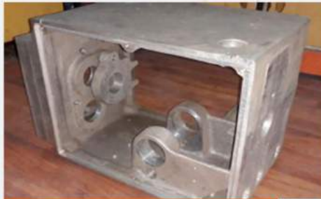
HSES Drive Frame Wt: 23Kgs