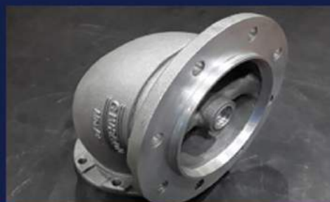
Maxair BodyUsed in Fluid Transfer.....