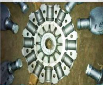
Die Cast Hubs Used in Power...