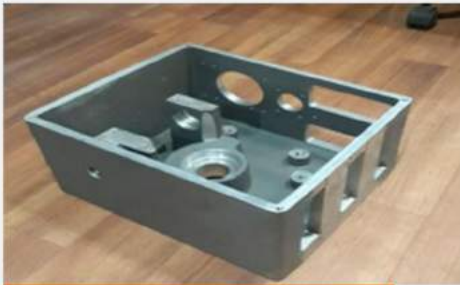
DSES Drive frame Wt: 12Kgs

Castings for Gas Insulated Switchgear ( GIS)