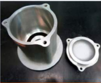
Emergency Valve Poppet & Cap