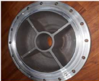
Filter Cover Wt: 15Kgs