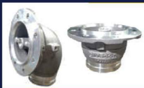
Maxair BodyUsed in Fluid Transfer ....