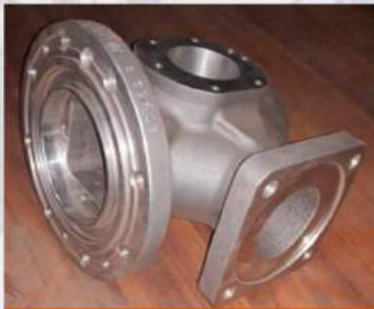
Earthing House Wt: 6.5Kgs