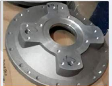
Cover Plate Wt: 12Kgs