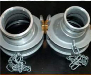
Gravity Couplers in production