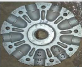
Gravity Die Cast Used in ....