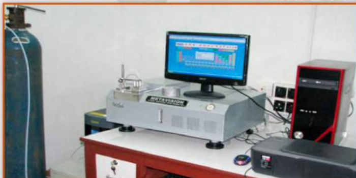
Atomic Emission Spectrometer

Chemical analysis done before pouring by Spectrometer