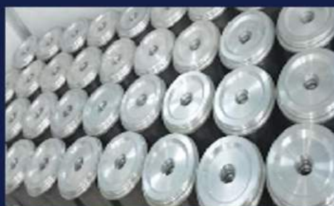
Petro Poppet Used in Fluid Transfer ....