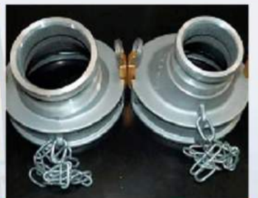
4 inch & 3 inch Gravity ....