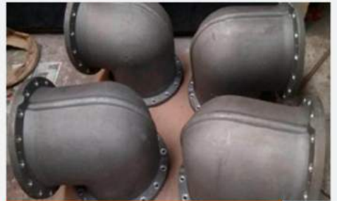
DI House machined Wt: 34 Kgs