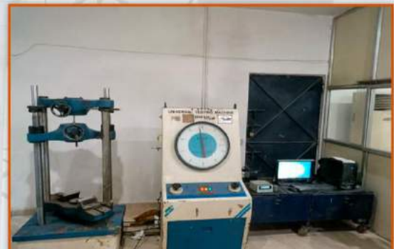
Digital Universal Testing Machine

Universal Testing Machine with auto load changer.